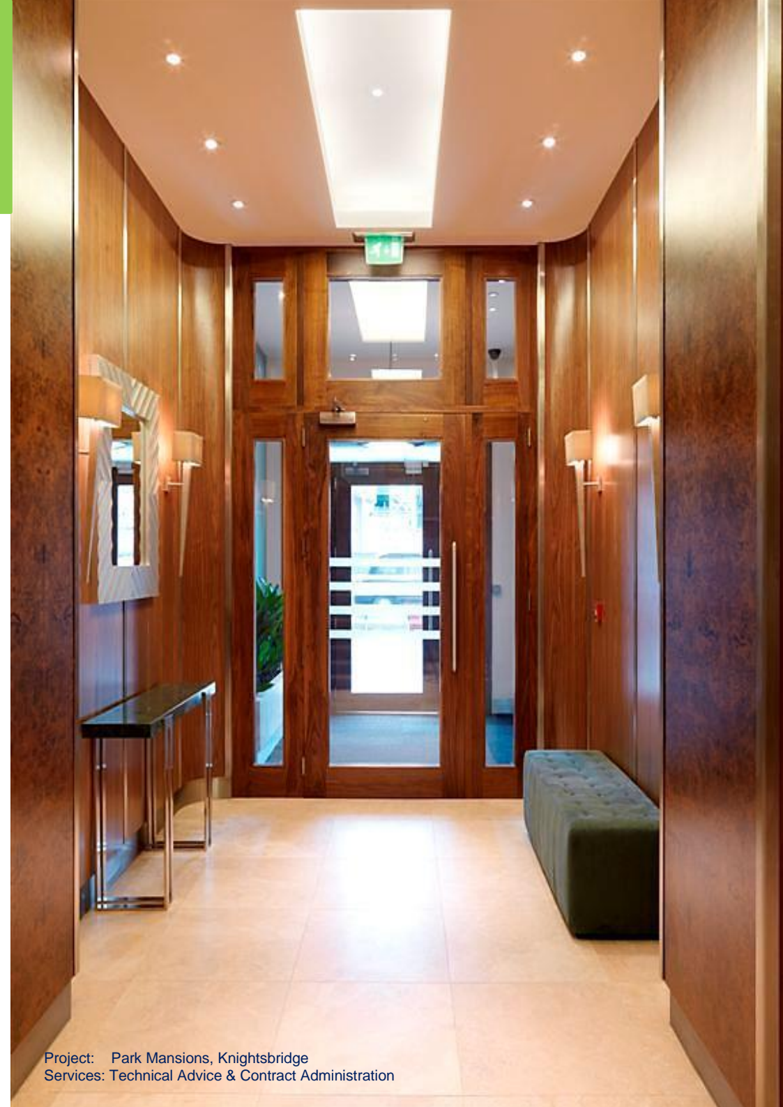
Project: Park Mansions, Knightsbridge Services: Technical Advice & Contract Administration

Please request our leaflet on Mediation to find out more.