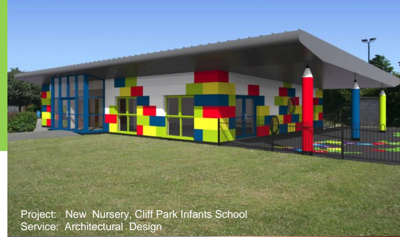
Project: New Nursery, Cliff Park Infants School Service: Architectural Design