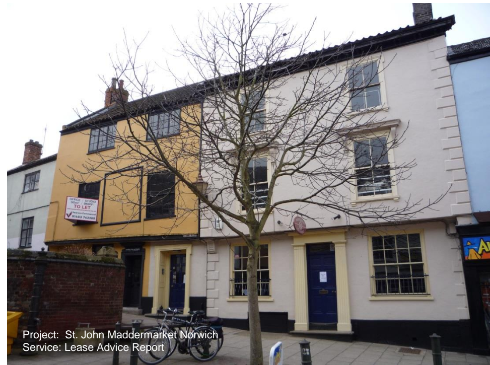
Project: St. John Maddermarket Norwich Service: Lease Advice Report

Building Contract (& dispute) Advice: Outlining contractual responsibilities for contractors, collateral warranty advice, traditional procurement and design & build contracts.