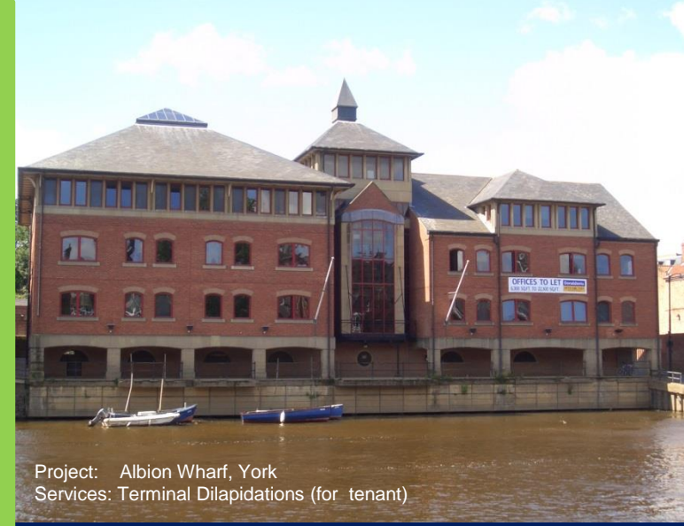
Project: Albion Wharf, York Services: Terminal Dilapidations (for tenant)