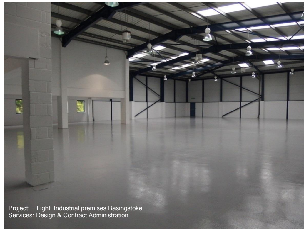
Project: Light Industrial premises Basingstoke Services: Design & Contract Administration