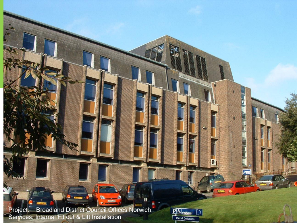
Project: Broadland District Council Offices Norwich Services: Internal Fit out & Lift Installation

Principal Designer: Acting as Principal Designer under the CDM Regulations. Provision of CDM consultancy services to designers and contractors.