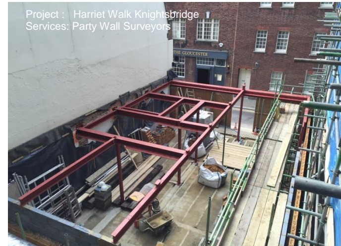
Project: Harriet Walk Knightsbridge Services: Party Wall Surveyors

Our party wall surveyors have a specialist academic interest in the Act and are therefore able to offer enhanced professional services in this field.