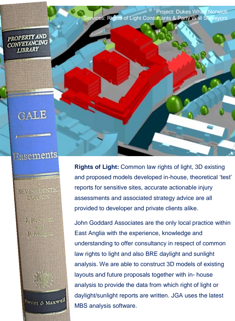
Project: Dukes Wharf Norwich Services: Rights of Light Consultants & Party Wall Surveyors

Rights of Light: Common law rights of light, 3D existing and proposed models developed in-house, theoretical 'test' reports for sensitive sites, accurate actionable injury assessments and associated strategy advice are all provided to developer and private clients alike.