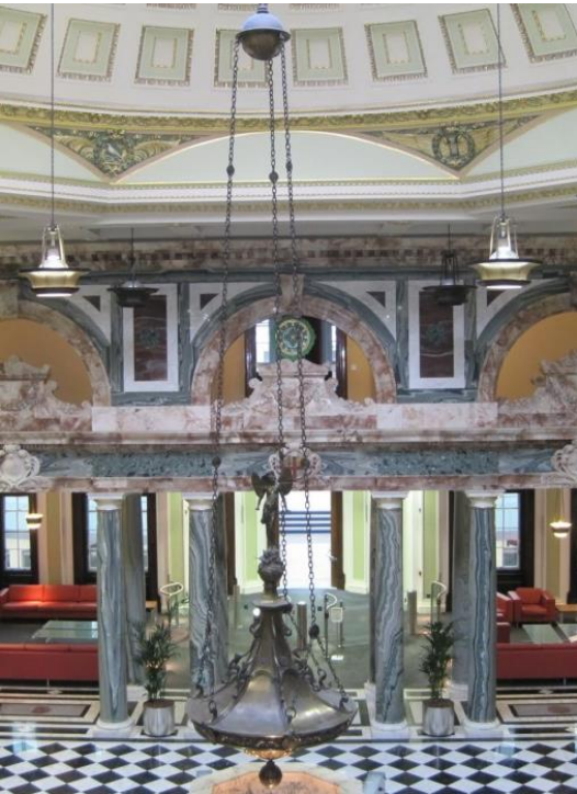
Project: Aviva Marble Hall Norwich Services: PMMP

Strategic budgetary planning for on-going maintenance & repair, 5 & 10 year prioritised maintenance programmes, elemental costs including inflation provisions and data extraction for specifications of work.