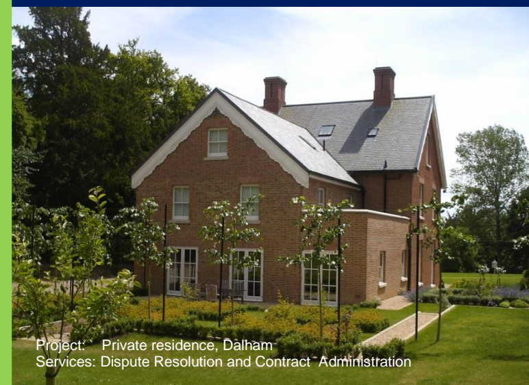
Project: Private residence, Dalham Services: Dispute Resolution and Contract Administration

We very much look forward to being your chosen professional consultant on your next project.