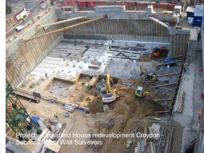
Project: Crossfield House redevelopment Croydon Services: Party Wall Surveyors

A robust and legally sound approach is always taken by our party wall surveyors, ensuring that the Act is dealt with as efficiently and expeditiously as possible, within the framework of often contentious situations. This is possible due to our specialist detailed knowledge of the Act in what can be a complex piece of legislation in terms of its correct interpretation.